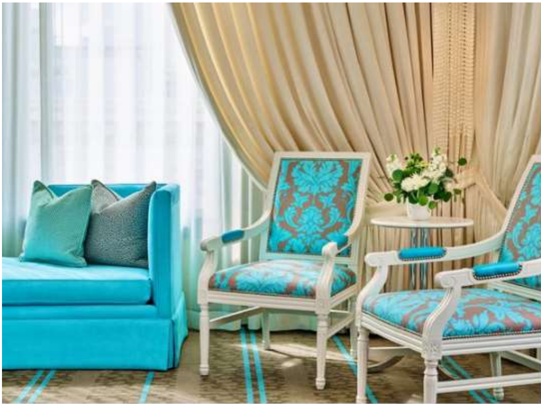
Tiffany blue-type velvet upholstery accent chairs are just a small part of the luxurious chic design of the Nines Hotel in downtown Portland, a Luxury Collection Hotel of Starwood.