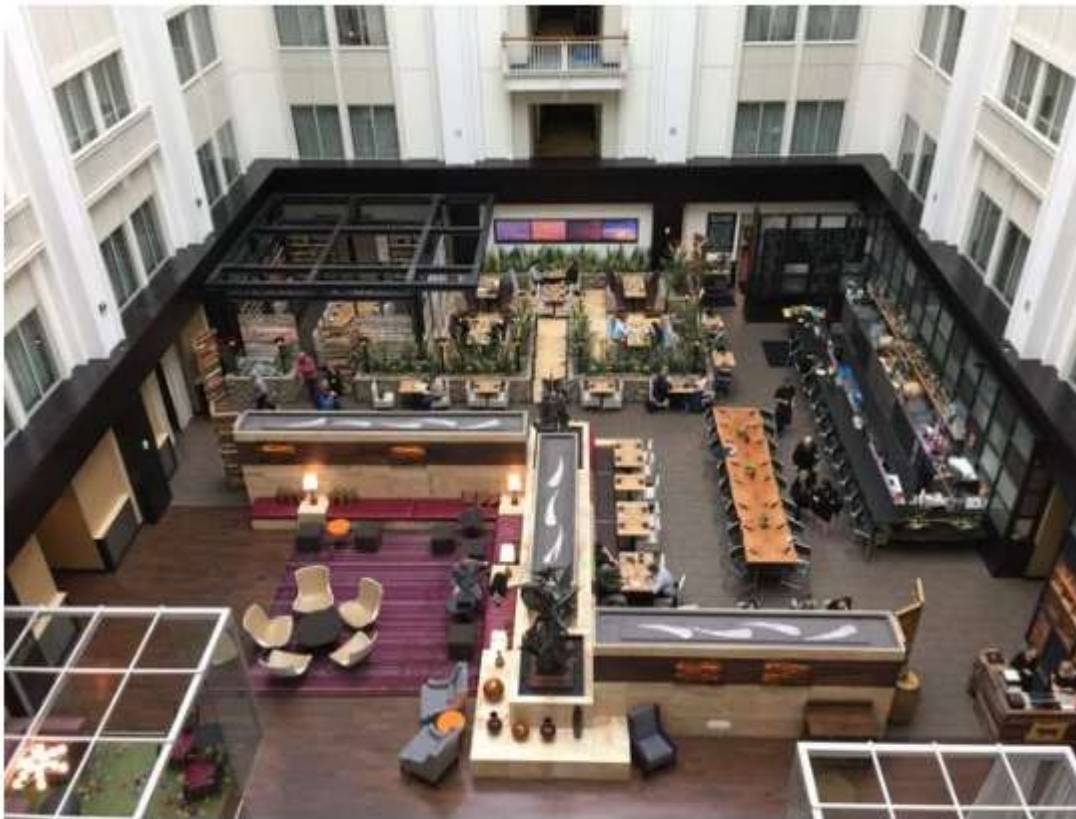
The lobby of the Nines and Urban Farmer, A Modern Steakhouse, in downtown Portland, Ore.

Dressed to the nines in my Texas best prêt-à-porter , I checked into Portland's ultimate shopping and eating base — the glamorous The Nines hotel.