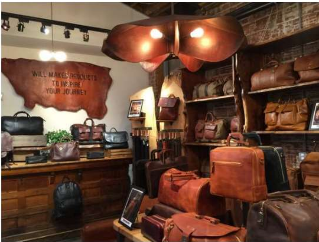
Will Leather Goods began in Oregon and now has stores across the USA, including this popular one in Portland.