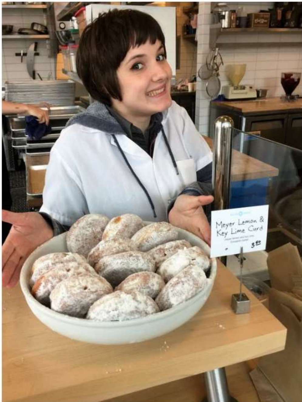
Serving Blue Star Donuts with a smile, this charming worker knows Portland residents love doughnuts, and Blue Star's sell out quickly each day. They make theirs from a classic brioche recipe that originated in the south of France. (Janis Turk)